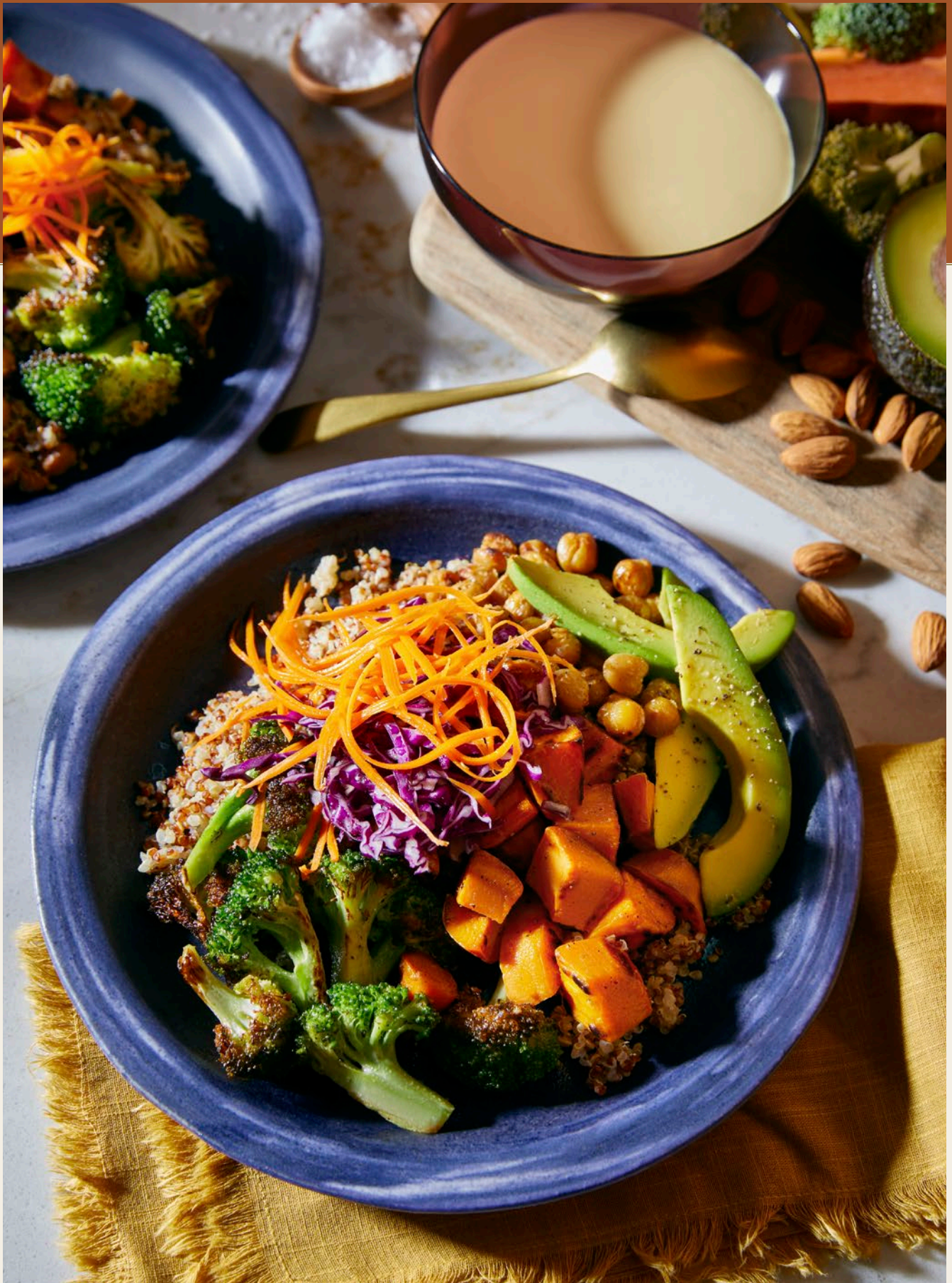
HIPPIE BOWLS WITH SECRET SAUCE