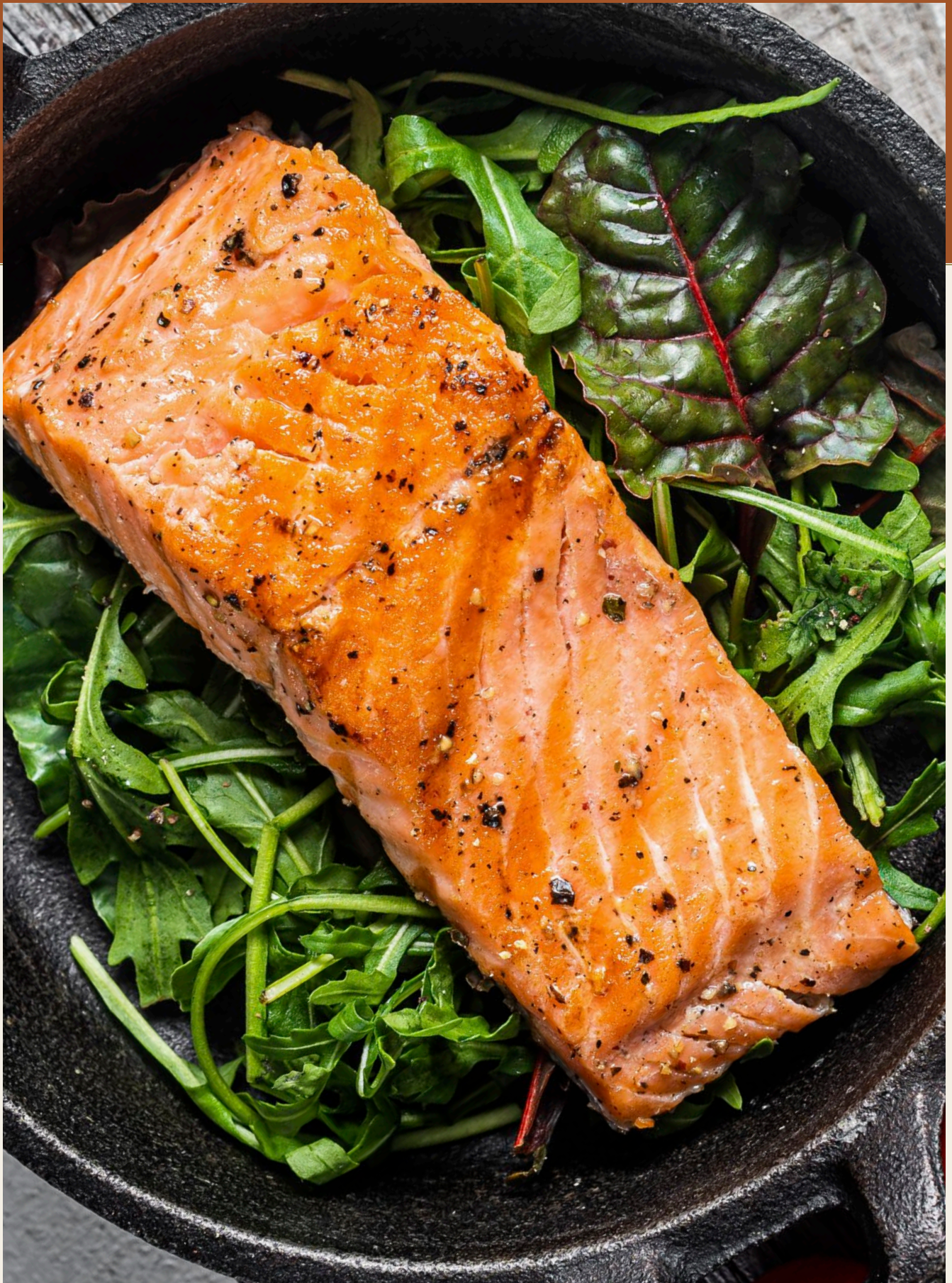
SALMON AND CAULIFLOWER RICE BOWLS