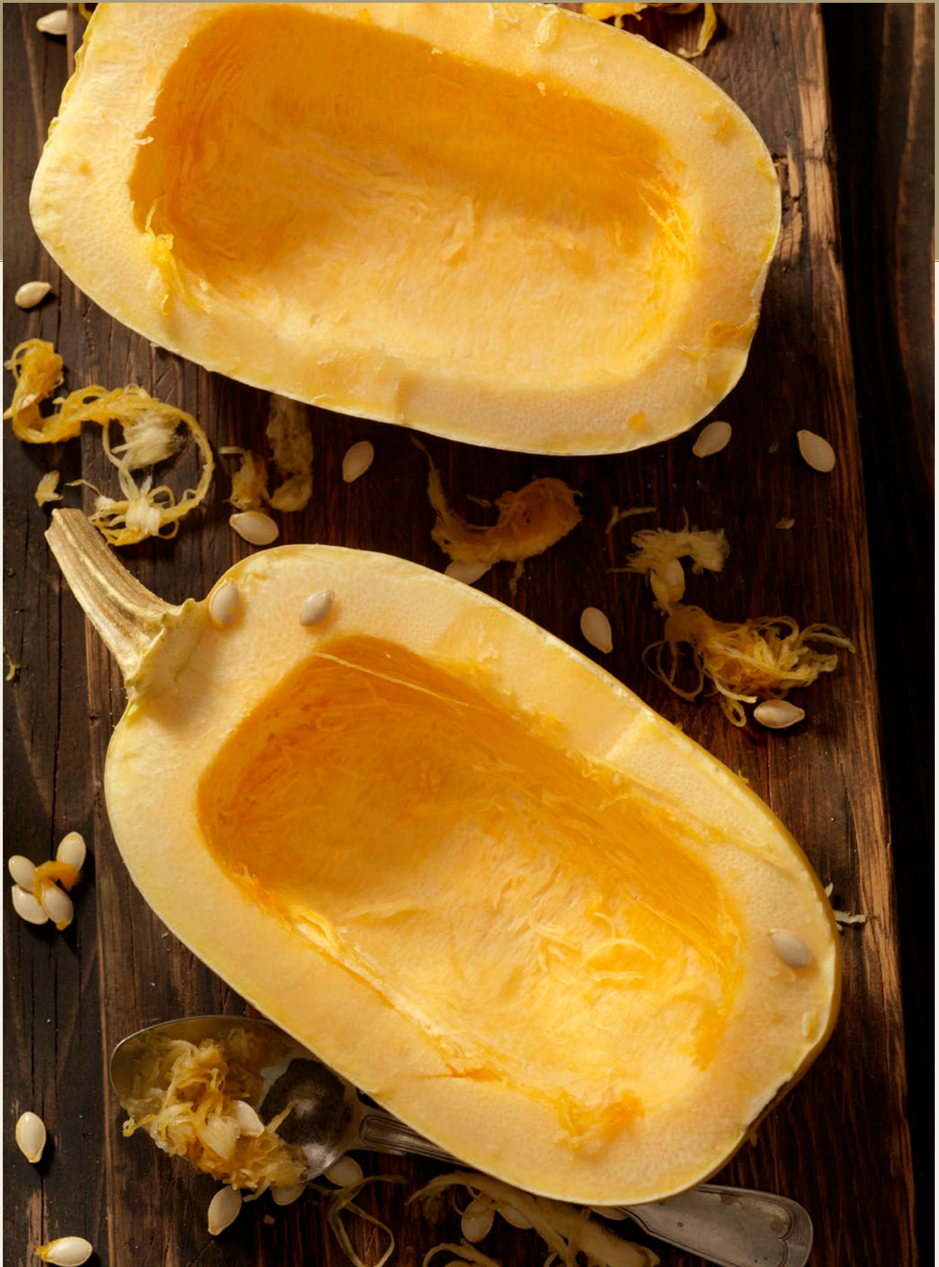
SPAGHETTI SQUASH ITALIANO