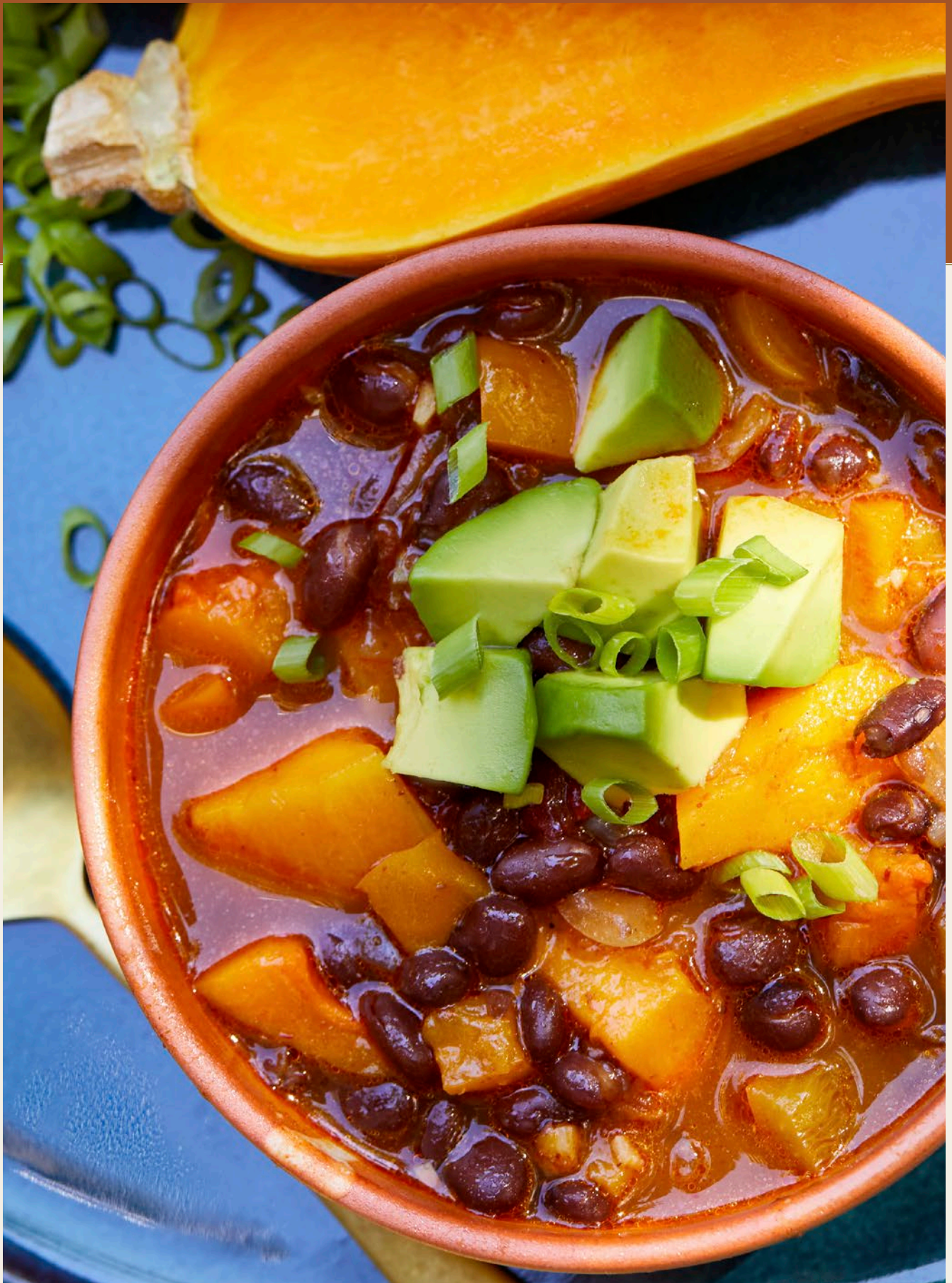
BLACK BEAN BUTTERNUT SQUASH CHILI