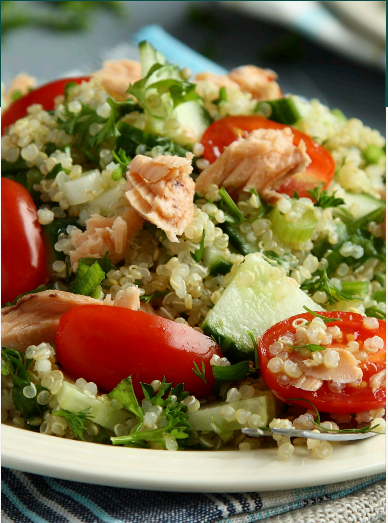
MEDITERRANEAN QUINOA SALAD